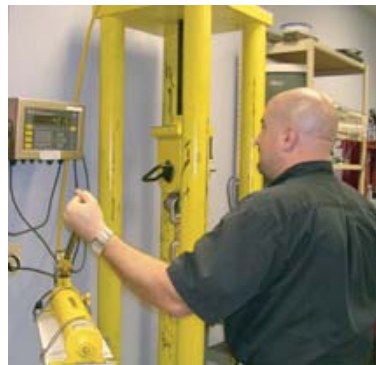
Crane Scale calibration up to 100,000 lbs