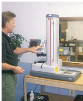
Force Measurement calibration up to 5,000 lbs