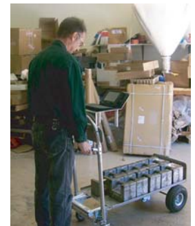
Weight calibration and verification services