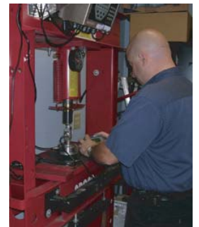
Pad Scale calibration up to 40,000 lbs