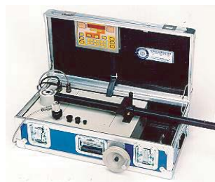
Torque calibration up to 800 ft lbs