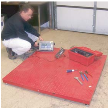
Industrial Scale calibration up to 20,000 lbs