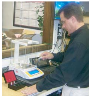
Laboratory calibration and repair services